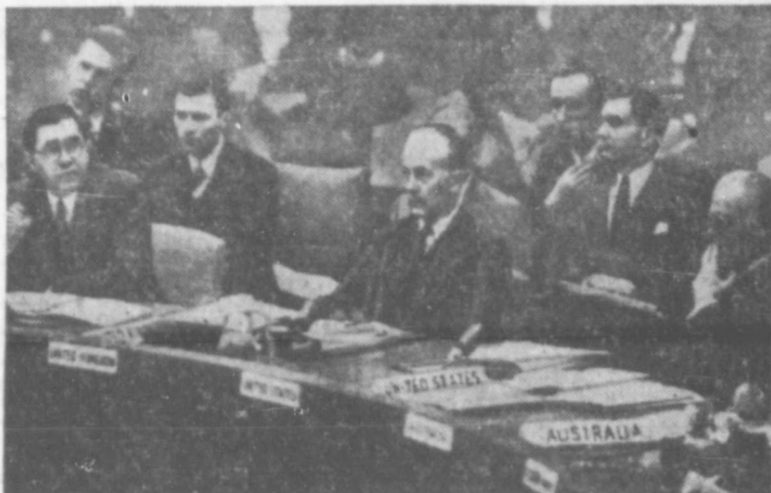
Russian Delegate Andrei Gromyko (left front) explains Soviet stand on disarmament while Alexander Cadogan of Britain (center) and Warren Austin of the U. S. (extreme right) listen attentively.

Released by Western Newspaper Union. (EDITOR'S NOTE: When opinions are expressed in these columns, they are those of Western Newspaper Union's news analysts and not necessarily of this newspaper.)