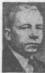
Robert R. Young Operating through Allegheny, Young

Young, a former New York stockbroker who catapulted into the national limelight by joining in purchase of control of the vast Van Sweringen railroad empire for only $510,000, heads the Allegheny corporation, which dominates the Chesapeake and Ohio, the Nickel Plate and Pere Marquette.