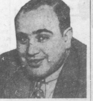
SCARFACE AL Still Newsy.

The former overlord of Chicago vice, whose name became a symbol of the gangsterism of the rip-roar-