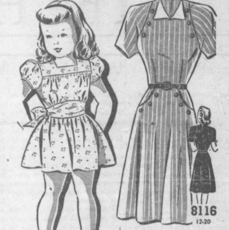
1569 1-5 yrs. 8116 12-20

Tot's Party Dress A DARLING little party dress for a wee mite that mother will find delightfully easy to sew. The full skirt falls softly from the pretty square yoke and is snugged in with a wide sash. Make it in a colorful flower print and trim with dainty lace or ruffling.