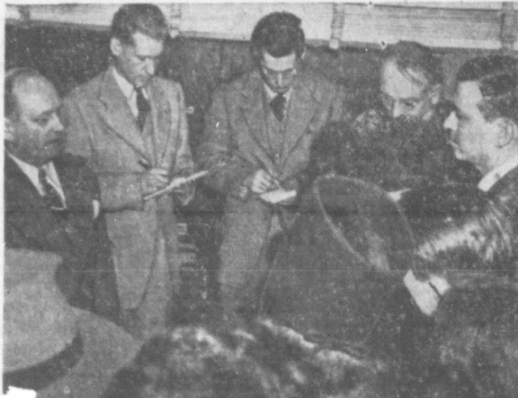
Governor Ellis Arnall (at left) faces Herman Talmadge (at right) in executive office in Atlanta, Ga., as latter claims post left open by death of his father. (See GEORGIA.)

ALLIANCE: Britain-France Traditional allies against Germany, Great Britain and France renewed their old bond in London by agreeing to a treaty of alliance to guard against a rebirth of an aggressive reich. Though the alliance ostensibly was directed against Germany, observers saw in the pact a strengthening of the western European powers against the expanded influence of Russia on the continent. With Britain and France serving as a core, smaller nations like Holland and Belgium might adhere to the western bloc to check the threat of communism. In concluding their alliance, Britain and France agreed to work for the orderly development of western European economy to promote mutual prosperity and at the same time prevent establishment of a strong industrial base for war in Germany. Emphasis was placed on harmonizing the British and French economies to remove trade conflicts and harnessing essential German industry, like coal, to the needs of neighboring countries.