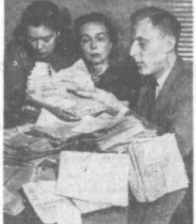
Members of White House secretarial staff pore over flood of telegrams complimenting President Truman on strike action.

In testifying in behalf of President Truman's plan for helping arm and organize South American countries and Canada in a grand defense system, General of the Army Eisenhower and Fleet Admiral Nimitz told a congressional committee that hemispheric solidarity would discourage aggressive designs against this part of the world.