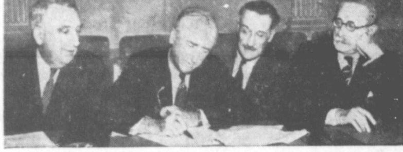
WASHINGTON SCENE— In top panel, General Eisenhower (left), and Admiral Nimitz (center), ask for Pan-American defense in testimony before house military committee presided over by Representative Bloom (Dem., N. Y.), at right. In lower picture, Treasury Secretary Vinson (left), watches Secretary of State Byrnes sign French loan agreement as Ambassador Bonnet and Leon Blum of France also look on.