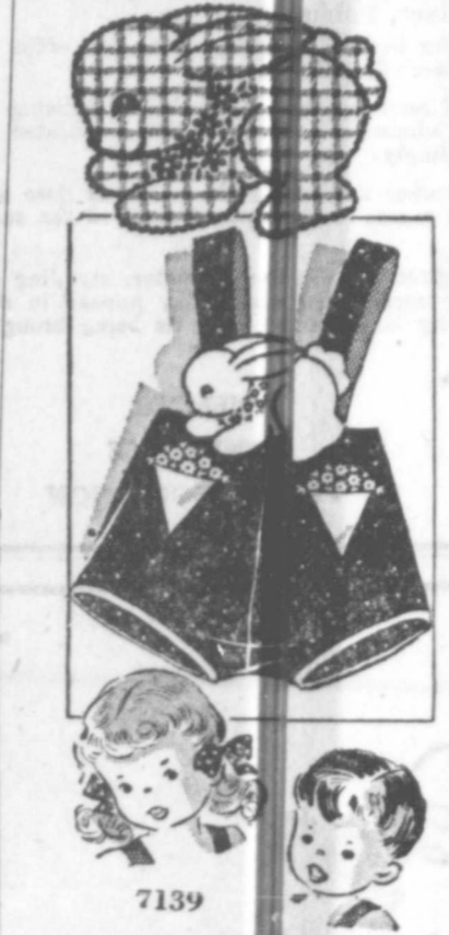
7139 THREE-QUARTERS of a yard plus a remnant for bunny bib and pockets make this small fry sunsuit! Stitches and sewing simple.

Summer's coming! Pattern 7139 has transfer pattern of one bib; pattern pieces for sizes 1, 2, 3, 4 (all in one pattern); directions.