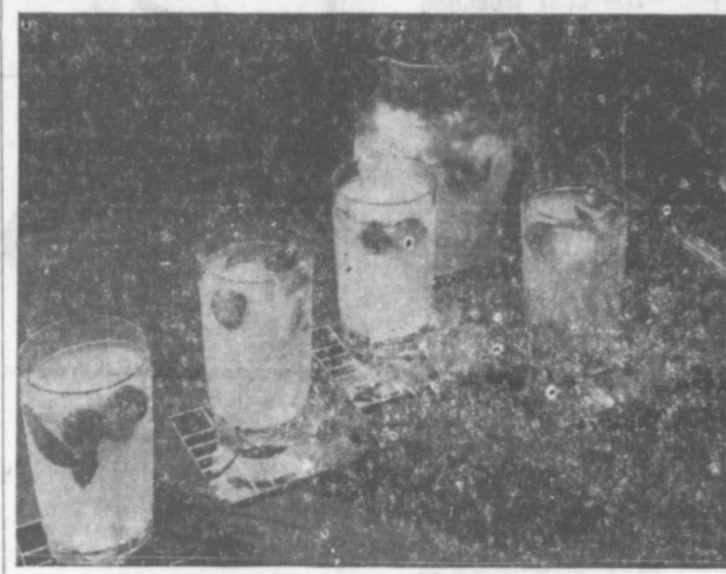
When Weather is Sizzling, Try Mint Ade (See Recipes Below)