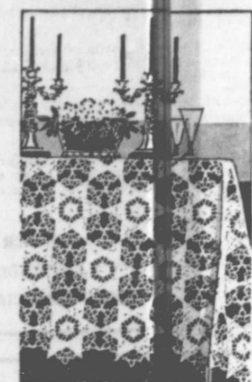
Pattern No. 404

THE STAR medallion is crocheted, starred for its handsome design, its lovely effect when joined for cloths, spreads, small accessories.