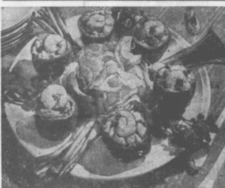
Shrimp-Stuffed Peppers Are a Surprise (See Recipes Below)