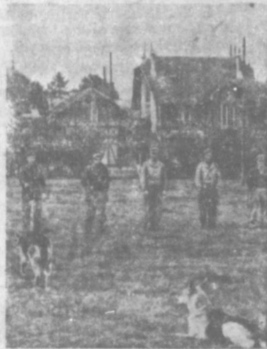
Ninth Air Force Military Police Unit training dogs during their off duty hours in Europe. War Bonds keep the dogs well fed and housed to be ready to aid our fighters. Buy War Bonds for this work as well as to save for your future. U. S. Treasury Department