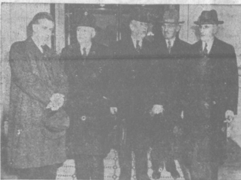
Democratic leaders leaving white house after pow-wow with President Roosevelt before opening of 79th congress included (left to right) Vice President Wallace, Speaker Rayburn, Senate Majority Leader Barkley, Vice President-Elect Truman, and House Majority Leader McCormack.

Released by Western Newspaper Union. (EDITOR'S NOTE: When opinions are expressed in these columns, they are those of Western Newspaper Union's news analysts and not necessarily of this newspaper.)