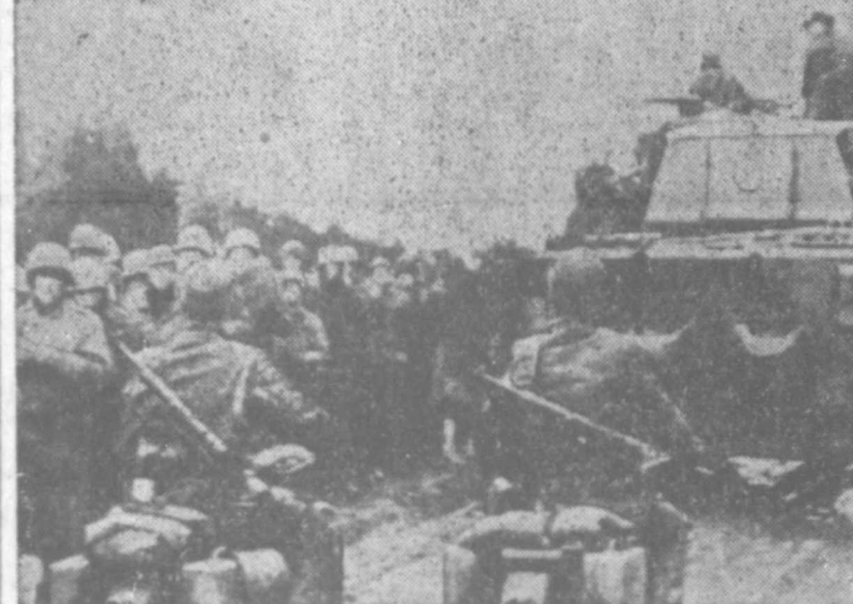
Taken from roll of captured German film, picture shows American prisoners being taken to rear as German drive roared through Belgium.

Released by Western Newspaper Union. EDITOR'S NOTE: When opinions are expressed in these columns, they are those of Western Newspaper Union's news analysts and not necessarily of this newspaper.