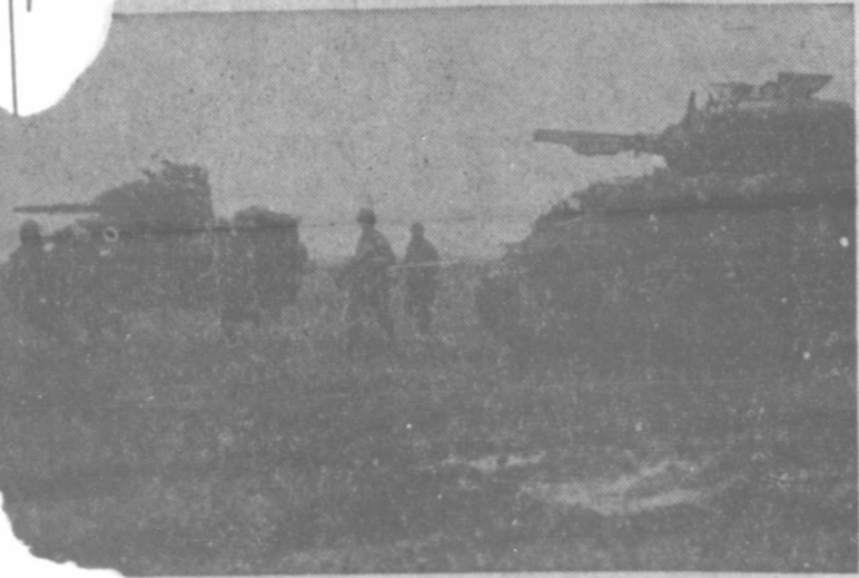
by tanks in the rear, U. S. infantrymen advance near Gellen-Germany on western front.

Released by Western Newspaper Union. NOTE: When opinions are expressed in these columns, they are those of Western Newspaper Union's news analysis and not necessarily of this newspaper.