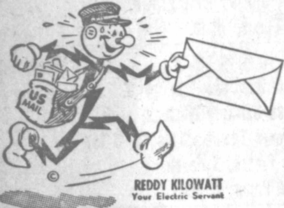
REDDY KILOWATT Your Electric Servant

Army and Navy rules for shipping unsolicited Christmas packages overseas are the same as for last year—but correct addresses are more important than ever.