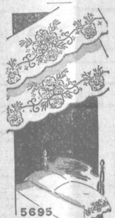
Worked in Cross Stitch

COLORFUL big pansies —three inches across—done in shades of purple, lavender, pale yellow and a touch of lipstick red make exciting designs on linen pillowcases, hand towels or on pale green, lavender or yellow tea cloths. Design is completely worked in cross stitch so that even an amateur embroiderer can't help but have them turn out beautifully. A grand gift item!