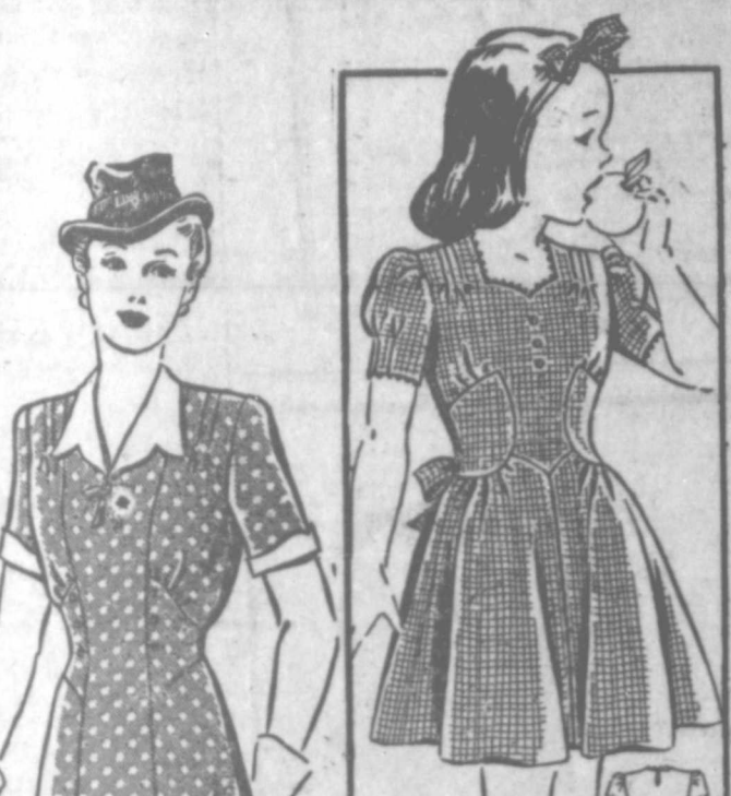
8554 6-14 yrs.

Pattern No. 8554 is in 4, 8, 10, 12 and 14 years. Size 8 takes 2 1/2 yards 36-inch material.