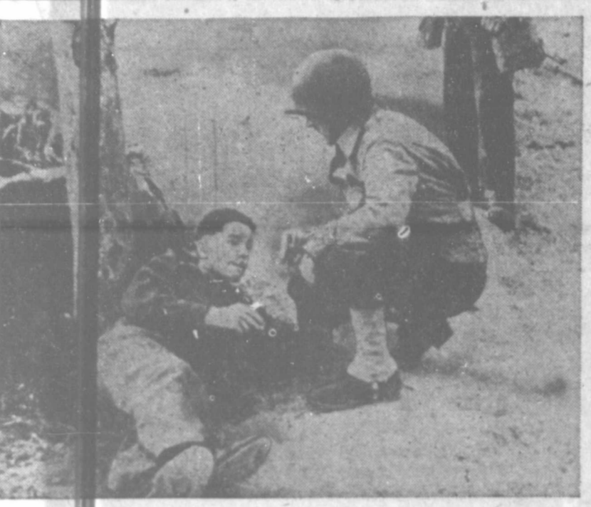
A wounded U. S. soldier struck during a heavy air attack by German planes on the airfield at Souk el Arba in Algeria is shown being comforted by a comrade-in-arms. The airfield was originally captured by U. S. paratroopers.

NOTE: When opinions are expressed in these columns, they are those of Western Newspaper Union's news analysts and not necessarily of this newspaper.