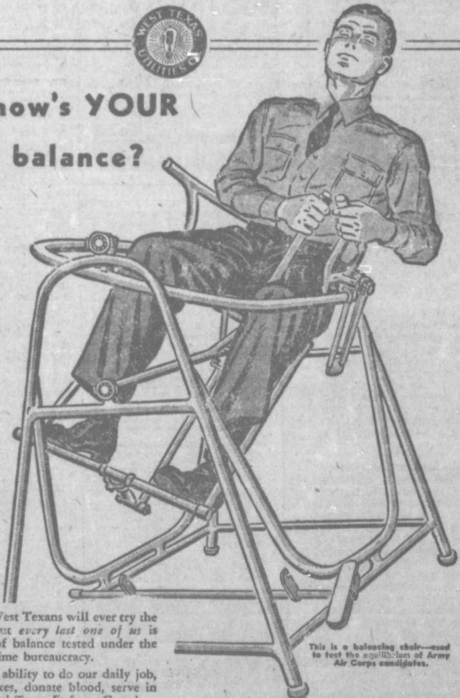
This is a balancing chair—used to test the equilibrium of Army Air Corps candidates.