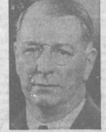
SEC. OF NAVY FRANK KNOX

Immediate steps to implement this movement were taken when the house naval affairs committee