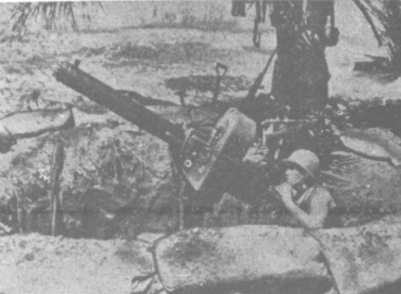
Ready for instant action is this marine corps gunner pictured behind a 50 caliber anti-aircraft gun at Guadalcanal, Solomon Islands. The Japs have been busy reinforcing their troops on Guadalcanal for an assault to wrest the airport from the marines.

(EDITOR'S NOTE: When opinions are expressed in these columns, they are those of Western Newspaper Union's news analysts and not necessarily of this newspaper.) Released by Western Newspaper Union.