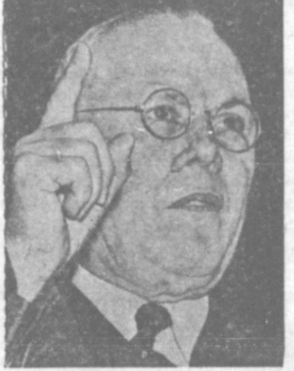
WILLIAM GREEN "I don't want Lewis . . ."

Speaking at a press conference in Toronto, William Green, president of the American Federation of Labor, said that there is "no place" for John L. Lewis and his United Mine Workers in negotiations for labor peace and unity with the CIO. "I don't want Lewis participating in the conference in any way,"