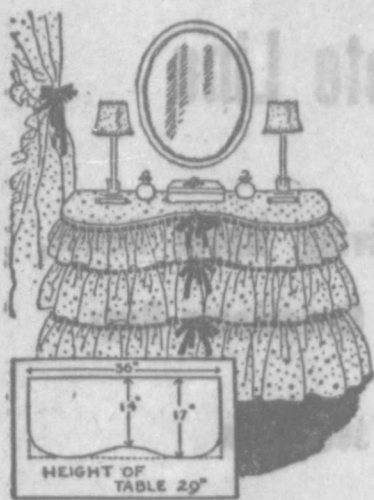
Underneath It's a Packing Box.

THIS is what your bedroom needs—a Southern-belle vanity! Between frothy ruffles of red-dotted white swiss you get tantalizing glimpses of red ribbon, run through beading and tied in bows. Darling, with pretty curtains and bed-spread to match! Our 32-page booklet tells details of making the vanity. Also tells how to make inexpensively a book-rack side table, pillow tops, pot holders, many other attractive items for yourself or as gifts. Send your order to: