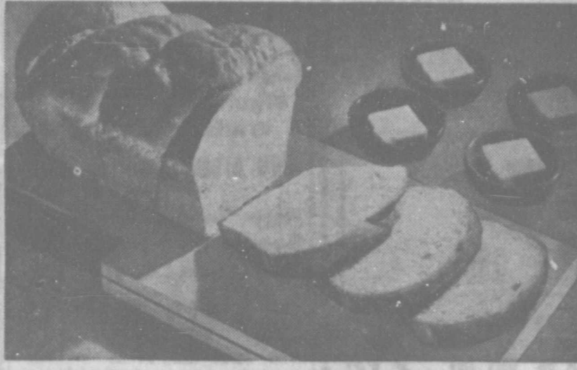
Keep on Your Toes With Enriched Bread! (See Recipes Below)

Bread 'n Butter Bread is one of our oldest and best-liked foods. But bread, like many of our other foods, has changed considerably during the last two years. You haven't noticed? Well, it's been enriched and fortified with the B-vitamins, often called morale builders because of the fine things they do for your system, digestion and disposition.