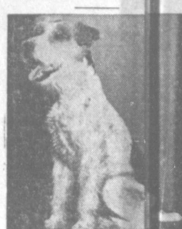
Baths, Clipping Can Be 1

Mistakes to Be Avoided In Summer Care of Dogs