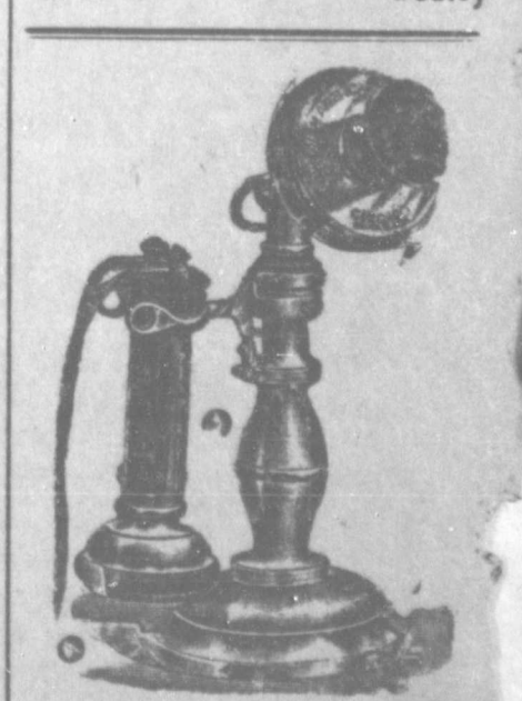
HONE 29 when you know a News Item