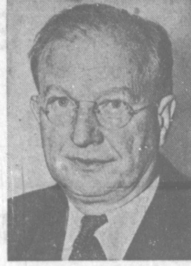
SENATOR WHEELER From him—a charge, From him—a denial. (See Below: ICELAND—and Bases.)

(EDITOR'S NOTE—When opinions are expressed in these columns, they are those of the news analyst and not necessarily of this newspaper.) (Released by Western Newspaper Union.)