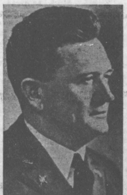
Lieut. Col. Lewis B. Hershey (above) has had power of the director of selective service conferred upon him by an executive order of President Roosevelt. His appointment is effective immediately and will continue pending the appointment of a regular director.

Meanwhile, the French had beaten the British navy in an action off Dakar, in West Africa. It raised a storm in England, and did not add to Churchill's prestige.