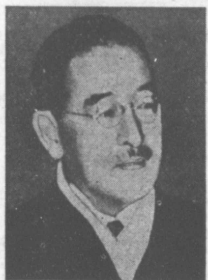
AMBASSADOR SABURO KUROSU, Japan's envoy to Germany, who signed the tripartite consultative pact, linking Germany, Italy and Japan for his government.

One 2,000 pound, 16-inch, battle-ship-piercing shell. In short, what a devilish trade, as the missionaries could have told us over three years ago!