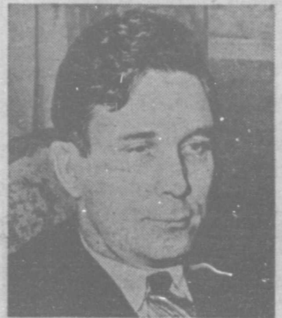
WENDELL WILKIE He has an answer for a tough problem.

The President told congress, dramatically, in joint session, that he wanted a billion bucks and 50,000 warplanes to defend our country against 3,000-mile blitzkriegs. Two-thirds of the billion were to go to the U. S. army. Roosevelt hinted that it might be nice to raise the legal national debt limit—which is $45,000,000,000. He asked that he be given $100,000,000 in cash, to provide for "emergencies." But an answer, in part, came from presidential possibility Willie, in an Indianapolis speech. Willie said that adequate national defense depended on domestic recovery. Meanwhile, the continentalists rallied against the anglophiles and internationalists, in and out of congress. Senators Johnson, Norris and Wheeler—all of them, naturally, pro-ally—were