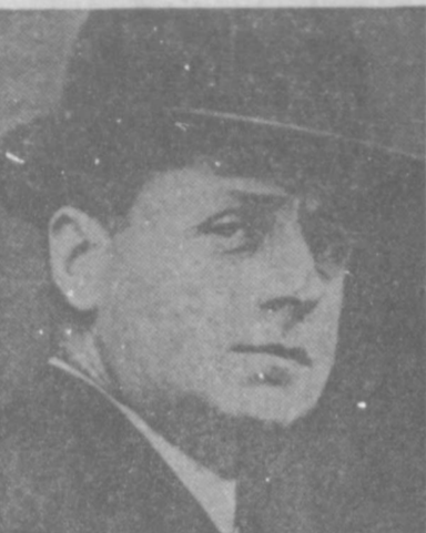
VON RIBBENTROP scurried . . .

Europe was filled with shenanigans on St. Patrick's day. As Holy Week got underway the dictators sheathed their swords and tried to look righteous. The imaginary axis running from Berlin southward through the Brenner pass to Rome became a well-trodden highway as