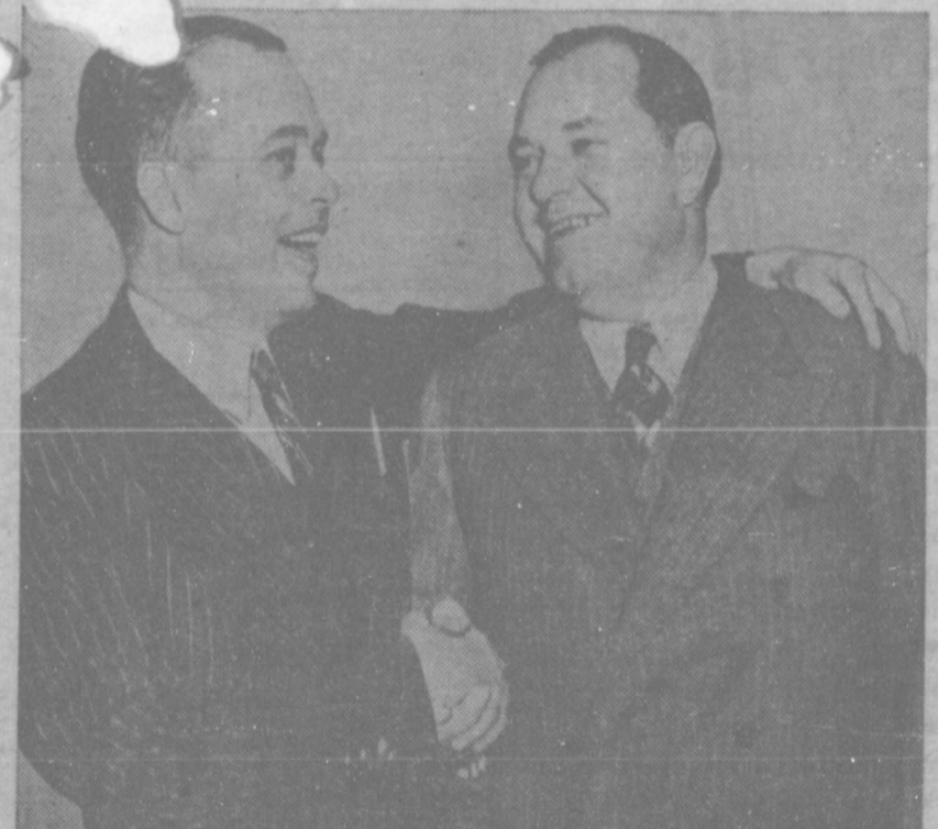
Sam Houston Jones, left, who ran second to Gov. Earl Long in the Louisiana Democratic primaries, embraces James A. Noe, third place candidate. The vote given Jones entitles him to a run-off election against Long in February. Noe announced he will swing his support to Jones in an attempt to beat Long, a brother of the late "Kingfish" Huey Long.