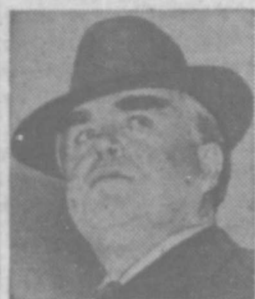
WHEELER He accepted...

A New Englander who comes from Montana went from Washington to Columbus one day in late January, indicating that Sen. Burton K. Wheeler has been around enough to rate as presidential timber.