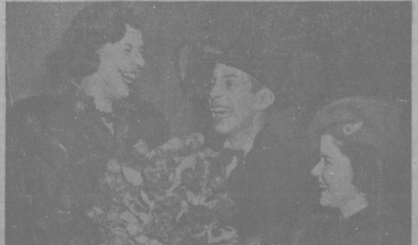
A railroad accident didn't prevent Mr. and Mrs. Raymond Massey from reaching a dinner party given by President and Mrs. Roosevelt. The train stalled en route to Washington from Chicago, the party completed by plane. Massey, an actor, has won fame for his port of Abe Lincoln.