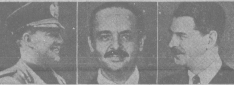
CIANO Starter. CSAKY Complainer. CAROL Defender.

TWO unrelated but parallel efforts originating in London and Rome are converging in Belgrade, Yugoslavia, on February 2, when Balkan states meet to discuss neutrality and self-defense against Russia. The efforts: