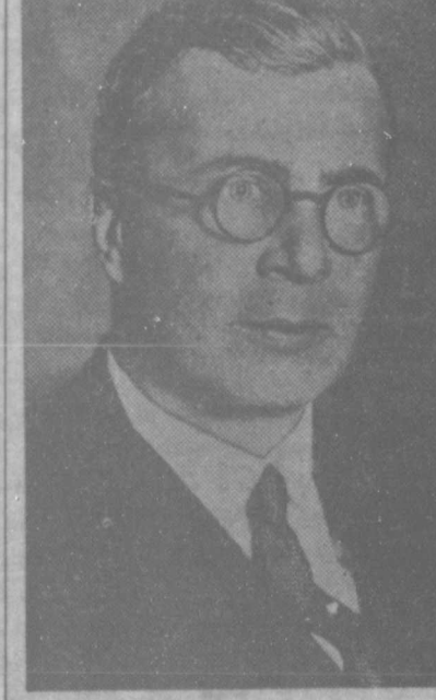
Conservative Stanley Oliver, above, was given a recent interim appointment as British war secretary supplanting youthful and daring Leslie Hore-Belisha in the first major governmental shakeup of the present conflict. Oliver's appointment aroused a storm of controversy. The appointment of Sir John Reith to replace Lord Harold MacMillan as minister of information was also announced.