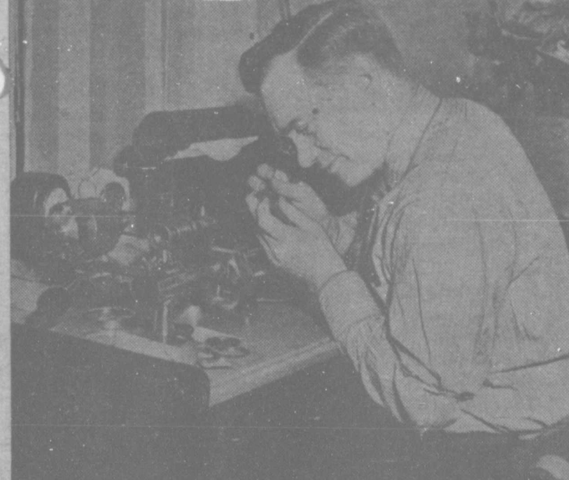
Warren K. Billings, who served 23 years of a life sentence in Folsom prison in connection with the San Francisco Preparedness day bombing in 1916, is now running his own watch-repairing shop in San Francisco. Billings learned the profession in prison, where he says he worked on 10,000 watches owned by fellow prisoners and prison officials. Billings is pictured at his workbench, surrounded by tools presented him by friends, many of whom worked diligently to secure his release from Folsom. Tom Mooney, convicted with Billings, was released from San Quentin after serving 22 years.