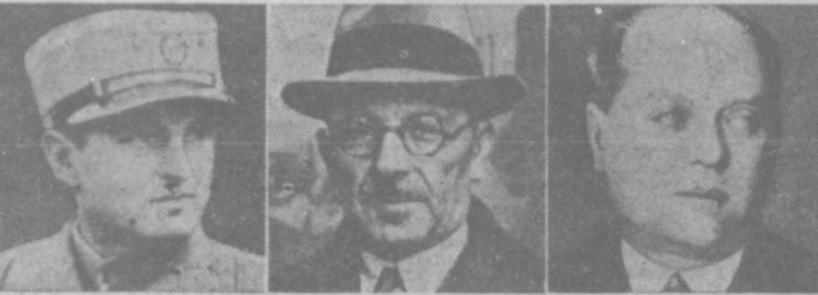
PAUL Mediator. SARACOGLU Co-operator. KIOSSEIVANOFF Another complainer.

Roman. Count Stefan Czakay of Hungary, which has revisionist claims against Rumania, met recently with Italian Foreign Minister Galeazzo Ciano, who urged Czakay to seek peace with Rumania as a defense against Russian aggression. In answer Rumania said nothing, but it was intimated King Carol would be ready to cede land to Hungary after the European war. A few days later he met secretly with Prince Paul of Yugoslavia, whom Italy has been encouraging to serve as intermediary between Hungary and Rumania.