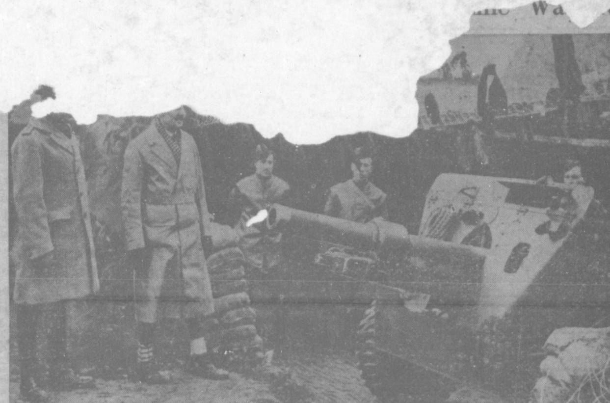
His umbrella discarded for the time being, Premier Neville Chamberlain of Great Britain is shown inspecting a camouflaged gun emplacement during his recent visit to the front lines in France. It was on this occasion that he replied to critics of the "boring" war with the sage remark that "it is better to be bored than bombed." The premier is equipped with boots and puttees, evidently prepared to rough it.

Relief in Tears It is some relief to weep; grief satisfied and carried off by tears.—Ovid.