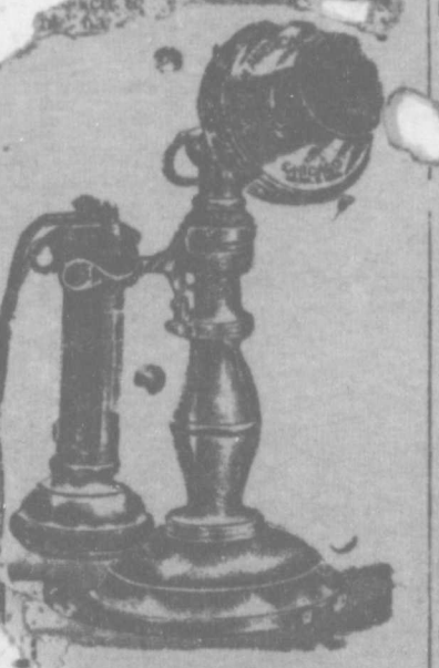
Only 29¢ when you know a News Item