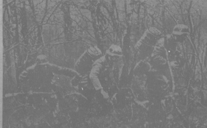
Steel-hatted German soldiers, serving as waiters, make their cautious rounds through the woods near the front line "somewhere in Germany" bringing rations for the garrison of an advanced outpost. The man in the foreground is a guard, whose duty it is to protect the food. There is probably a stew in the tureens on the back of the "waiters."