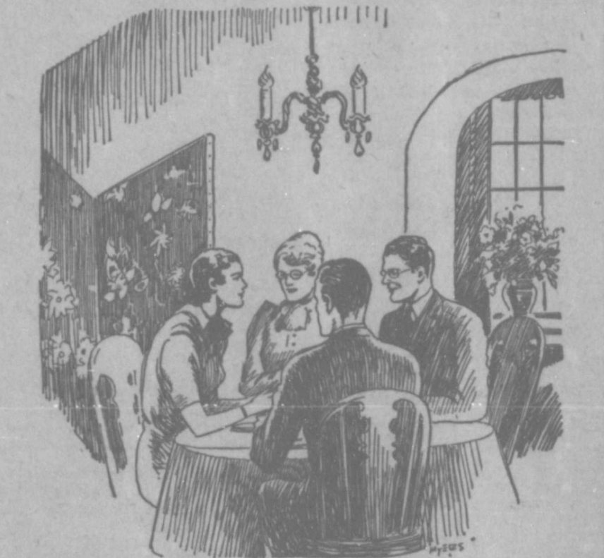
"It's Been Fun. Perfect. I Shouldn't Have Wanted It Any Other Way."

Whether you're planning a party or remodeling a room you should follow the advertisements... to learn what's new... and cheaper... and better. And the place to find out about new things is right here in this newspaper. Its columns are filled with important messages which you should read regularly.