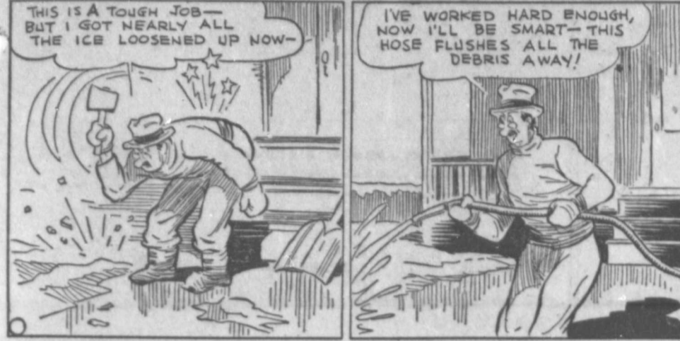
SMATTER POP— Yes Sir, There It Was!