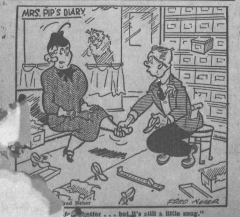
It's better... but it's still a little snug.