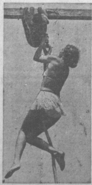
-wrist and hopping to a safe landing, proceeded to wrap himself around the beam, like the fur on a lady's coat collar. The Hollywood girl didn't win this time-but she certainly proved that there must be something to what Darwin preached.