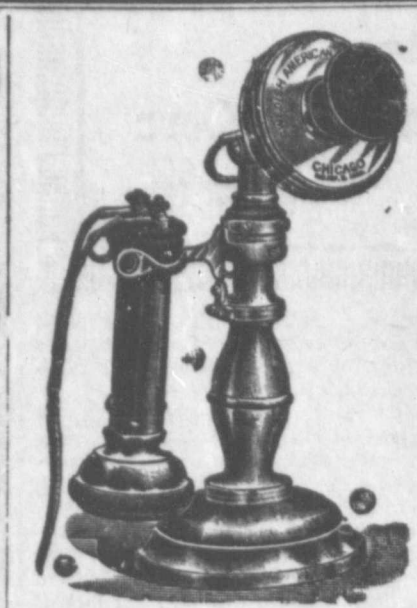
PHONE 29 when you know a News Item