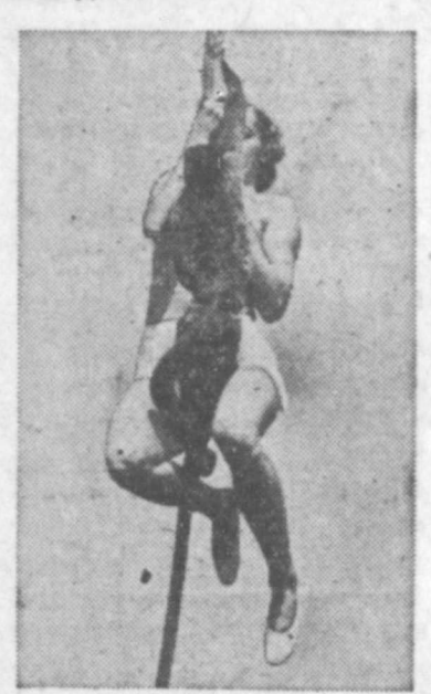
-here they are off to a good start, at the halfway mark.