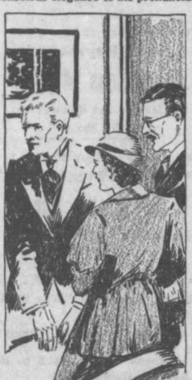
"Those Crooks Are Always Feeling Around for Suckers," Said

it and that's all right so long as he doesn't read it aloud. I could murder people who read poetry aloud. These radio mushtraps! The quiver of emotion in the voice, the selfconscious elegance of the pronuncia-