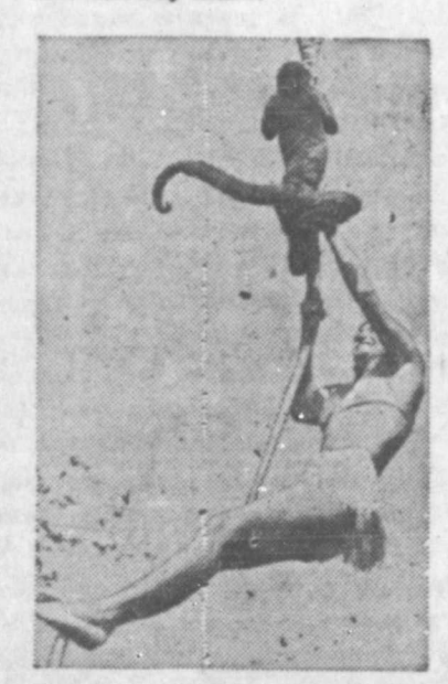
Mortimer Mopus-that's the monkey's name-cinched the race for himself, by stepping on the young