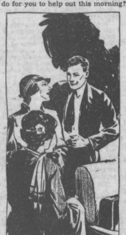
Both Were Glad When They Left Him.

'That is an idea, Miss Rachel! No waste, no cost, no argument in the house. Is there so'thing I could