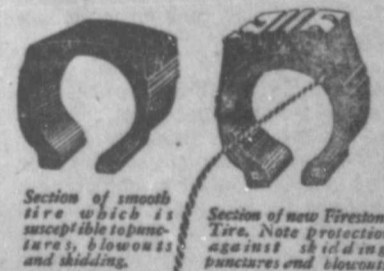
Section of smooth tire which is susceptible to punctures, blowouts and skidding. Section of new Firestone Tire. Note protection against skidding, punctures and blowouts.

THAT more than 40,000 of these deaths and injuries were caused directly by punctures, blowouts and skidding due to unsafe tires?