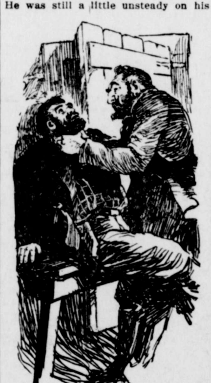
His Neck Snapped-a Little More and It Would Have Broken.

He replaced the pistol in its holster and drew a deep breath into his lungs