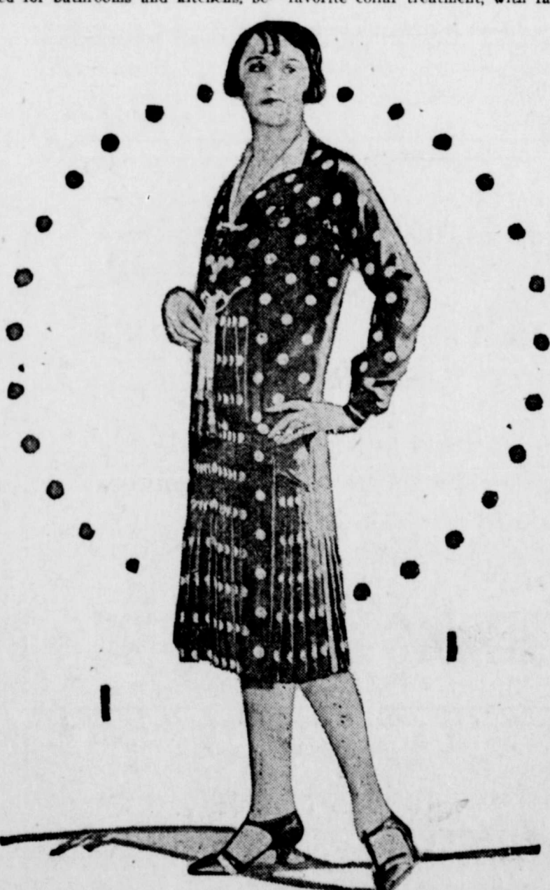
OF COIN DOT SILK

Among the unexpected revivals are mostly in navy and white or black larity a year ago stylists might have and these found a cordial welcome. favorite, a hardy annual, and therefore a good investment. The fine model shown in the picture embodies some new points to be featured in the fall styles, notably the bodice extendsides, over a skirt which is plaited all Besides these booked rugs of yarn around with front extended into a