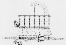
for the sensitive ones

ROY ROGERS AND DALE EVANS still appear on TV shows and have a museum for tourist trade in Apple Valley.