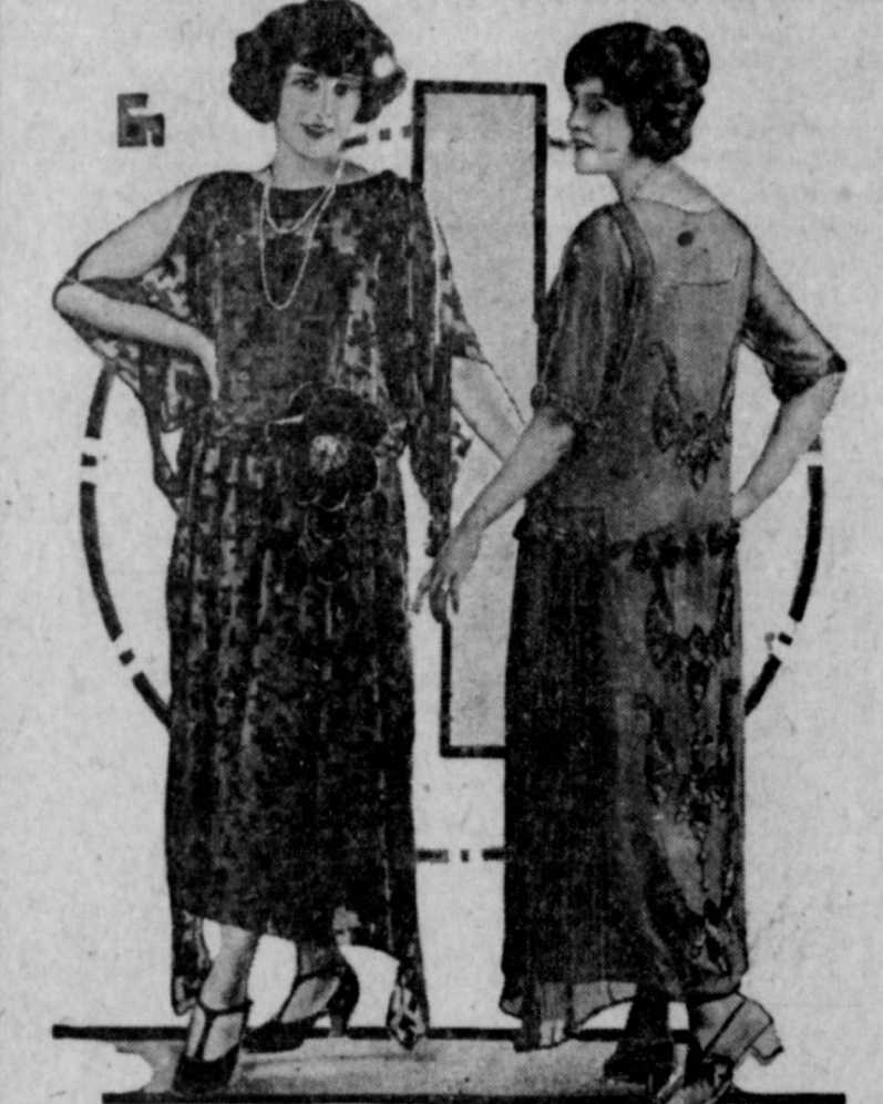
DRESSES WITH NOVEL TRIMMIN

THE efforts of designers, in all manner of costumes, at present, seems to be to achieve the greatest degree of simplicity and still advance novelties in trimming and materials. The early tendency toward intricate lines and drapes has apparently been put aside in favor of the straight silhouette, the very long skirt giving way to ankle lengths or even shorter styles. Naturally, with these restrictions, the novelty of each costume must depend on its material, its color or its trimming, but there is such a variety in these that the designers do not lack