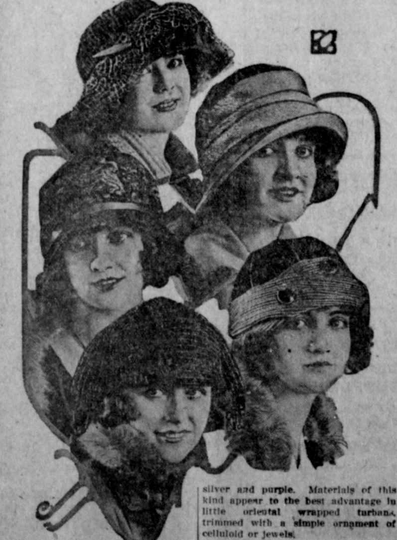
HATS OF SILVER AND GOLD

means to work with and new fashions do not suffer because of their uniformity in outline. In the illustration two new dresses are shown that display a great deal of individuality, though their lines are almost identical. The dress at the left is of georgette with a woven design of chenille which gives a broad effect. The draped sleeve fastens at the shoulder and elbow with tiny bows of velvet ribbon and a huge velvet poppy is posed at the waistline. There is a slight drape to the skirt, which falls in two points at the side. The model shown at the right is made of blue georgette crepe and has