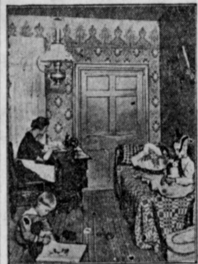
Sewing Room May Be Combined With Children's Play Room.

Motor Saves Strength. If one has electricity in the home and there are many garments to make, it saves strength to have an electric motor to run the sewing machine. Studies of the energy used in sewing have been carried on by the office of home economies of the United States Department of Agriculture. These