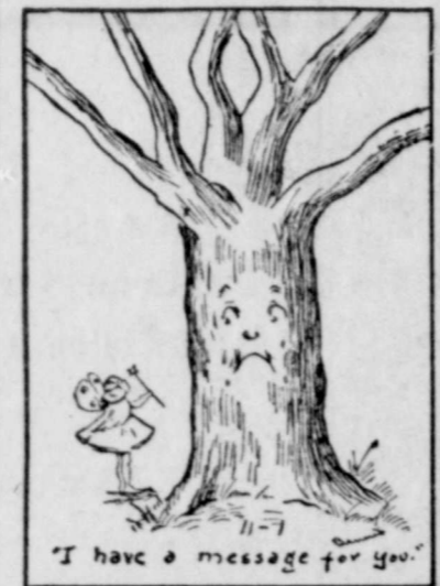
I have a message for you.

At first the Great Trees did not notice the evergreens and held their poor naked heads high with pride above their green-gowned neighbors, but it was no use pretending, for, as the days went by, the evergreens became