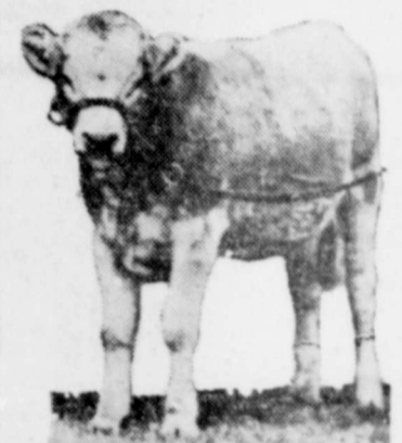
It is Easier to Prevent Calf Disorders Than to Cure Them.

Provide Nature's tonics—exercise, sunshine, pure air, abundance of fresh water and a variety of feeds—and