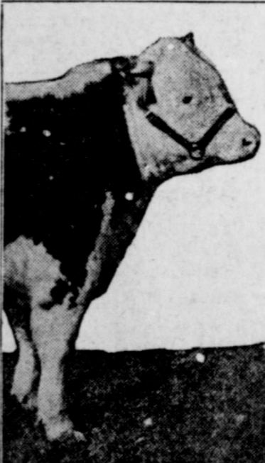
Good Breeding and Quality Are Necessary for Best Returns With Beef Calves.

When from four to six weeks old a calf may be taught to eat grain. This may be done by feeding it in a creep