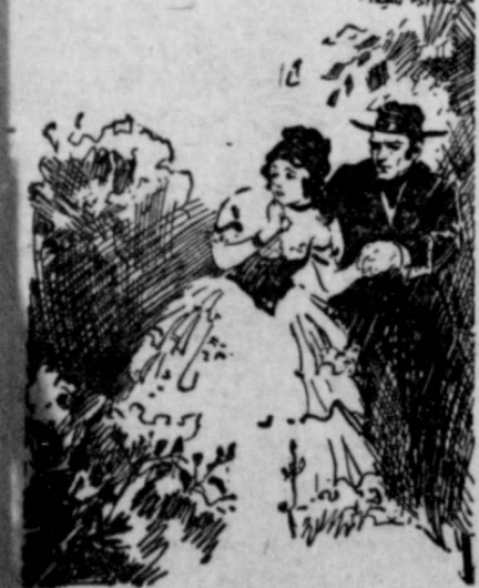
She Clung Tightly to Me, Shrinking Past the Motionless Figure.

She clung tightly to me, shrinking past the motionless figure. She was