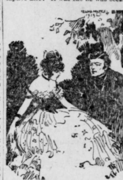
"Certainly Not. Why Speak Like That? Have You Forgotten Again That I am a Slave—a Negress?"

"But what are we to do?" "I had no ready answer, yet the echo of utter despair in her voice stirred me to my own duty as swiftly as though she had thrust a knife into my side. Do? We must do something! We could not sit down idly there in the swamp. And to decide what was to be attempted was my part. If Kirby and whoever was with him had stolen the missing boat, as undoubtedly they had, they could have possessed but one purpose—escape. They were inspired to the act by a desire to get away, to flee from the scene of their crime. They must believe that we were left helpless, unable to pursue them or create alarm. Yet if it was Kirby who had fled so swiftly, making no effort to take Rene captive also? It was she he was seeking."