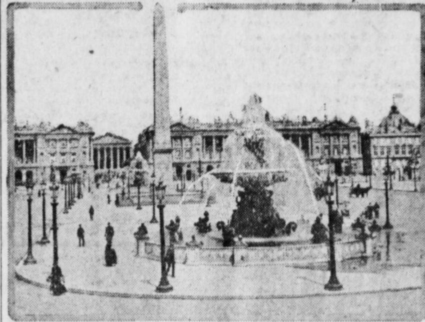
The Place de la Concorde.

The spot where France weeps has been a place of gladness since last November 11. What will be the next distinguishing feature of the Place de la Concorde, one of Paris' great places, and perhaps the most magnificent public square in the world? asks the Kansas City Star. Will it, too, be tragic? For an air of tragedy has hung to this splendid product of engineering and art. Thousands died there in the blood madness of the French Revolution; the allied armies of Napoleon held a solemn deum there in 1814; in 1871 the hated Prussians encamped in the beautiful square; later the same year it was the scene of fierce and bloody conflicts between Versailles troops and the Communards, who had erected barricades at one of the entrances; since 1871 the statue dedicated to the city of Strassburg had been continuously draped in mourning and known as the "Lost Sister," keeping alive in the minds of Frenchmen the theft of Alsace-Lorraine.