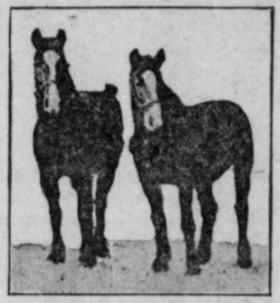
Two-Year-Old Belgian Colts.

The important stage of the youngster's life is now at hand. Separation from the dam must be complete to be