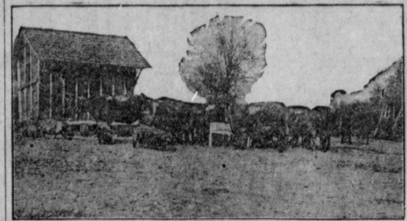
Cattle and Hogs In Feed Lot.