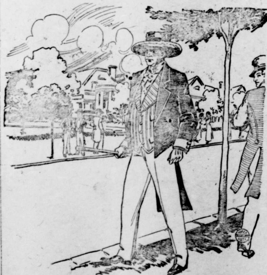
WHO IS THAT MAN?

We need in government, industry, philosophy, art, science and literature men whose walk through our lives will inspire us to high and mighty deeds and fill the Southland with a golden glow and cause future generations to instinctively pause and inquire, "Who is that man?"