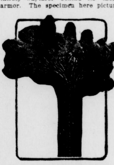
Unique Arizona Cactus was discovered on the rocky rim of

cactus world for scientists to puzzle gravy. If he has any spark of symon the river, as the Clermont had been over is shown in the accompanying pathy in his soul he will realize that succeeded by the Car of Neptune and picture. Whether a freak or a distinct variety which has hitherto escorded, was 173 feet long and alter- caped detection, botanists are unable to determine. Curiously enough it re-One of the hoodoo boats of the river sembles in general contour the famed "traveler's palm" of the tropics and. built in 1827. Her passengers were so like that valuable plant, the cactus stores up a quantity of water for the that sometimes they turned out of thirsty wayfarer behind its thorny