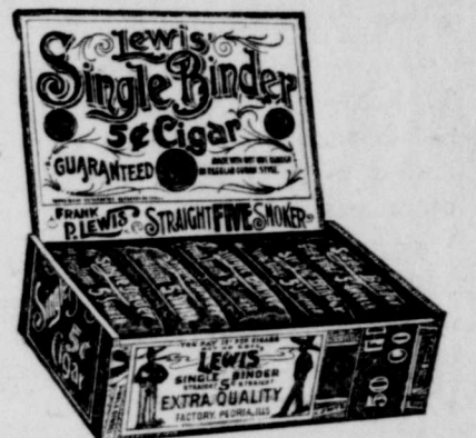
LEWIS' Single Binder costs more than other 5c. cigars. Made of extra quality tobacco.

It Invigorates, Rebuilds, Nourishes. Don't experiment. INSIST ON GETTING HOSTETTER'S