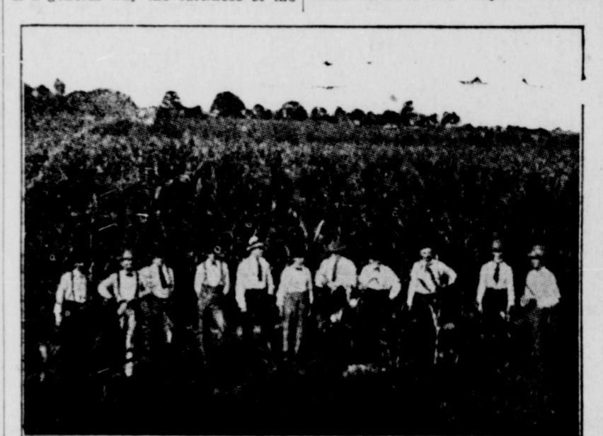
Cornfield on a Demonstration Farm, Showing a School for Farmers Engaged in Selecting Corn.

In brevity, the ear that should pre-(3) The height of the ear indicates sent the following characters: For in a general way the earliness of the most varieties the shape of the ear