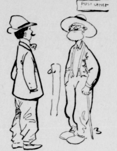
City Visitor—What are you folks in the country preparing to do this year? The Farmer—The summer boarder, as usual.