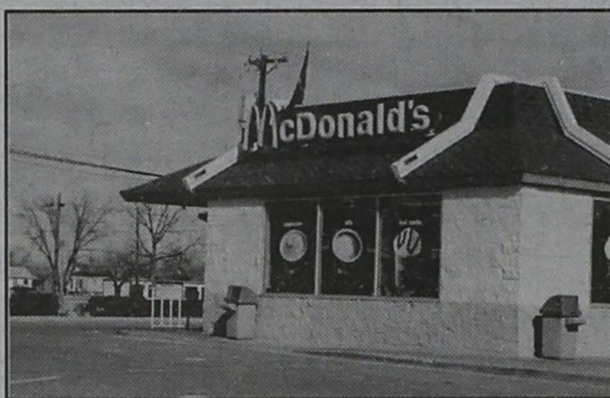
Silver Member – McDONALDS