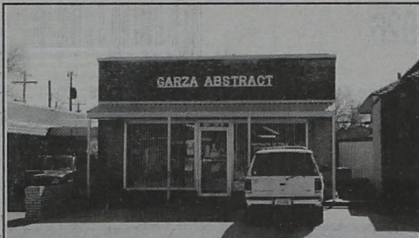
Gold Member – GARZA ABSTRACT

Congratulations to our Members of the Week: