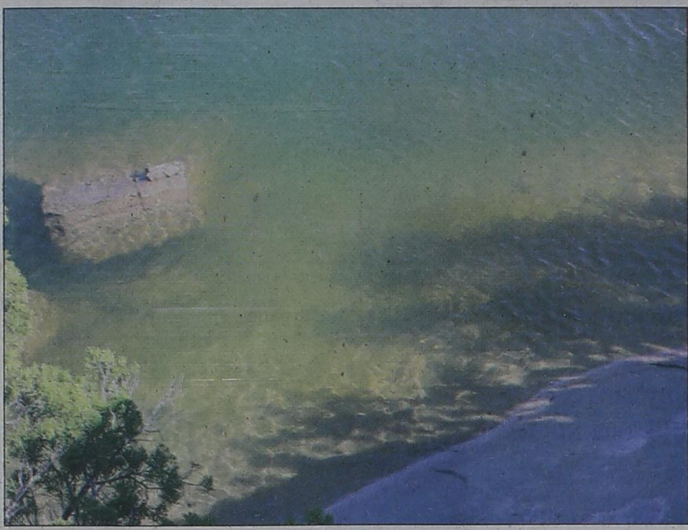
Clear, crisp and cool water keeps boaters and fishermen enjoying Lake Alan Henry on these hot summer days.