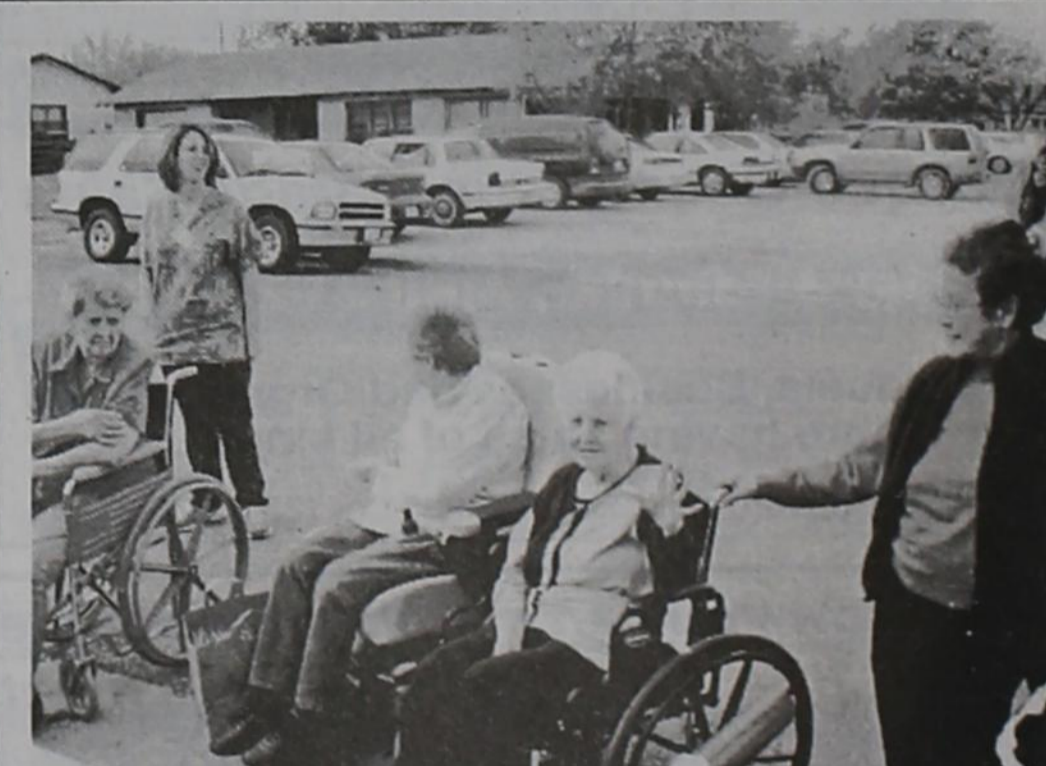
Golden Plains Care Center residents enjoyed the Easter Egg Hunt last Friday as children raced around the yard searching for the prized eggs.