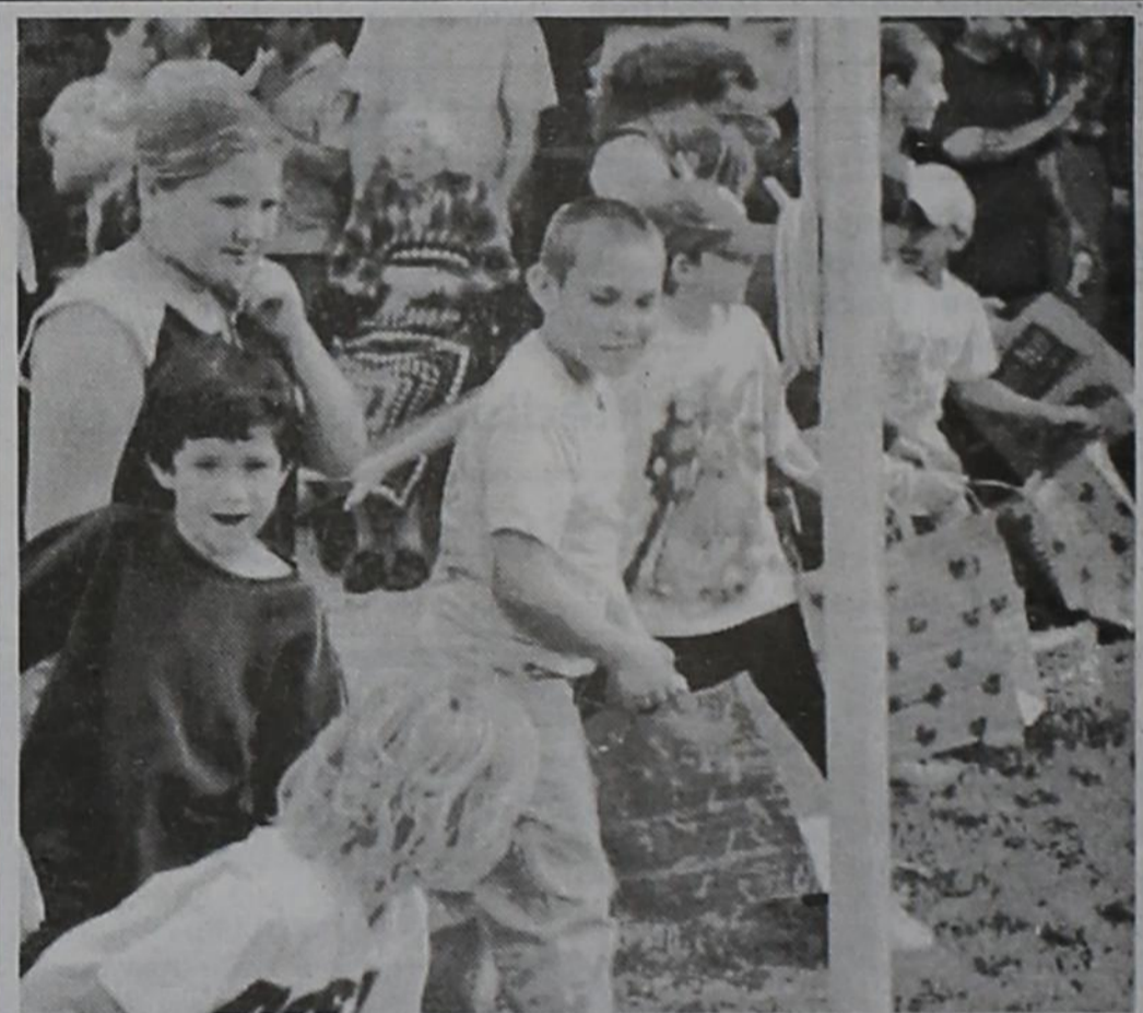
Children were scrambling for the eggs during last Friday's Easter Egg Hunt on the front lawn at Golden Plains Care Center.