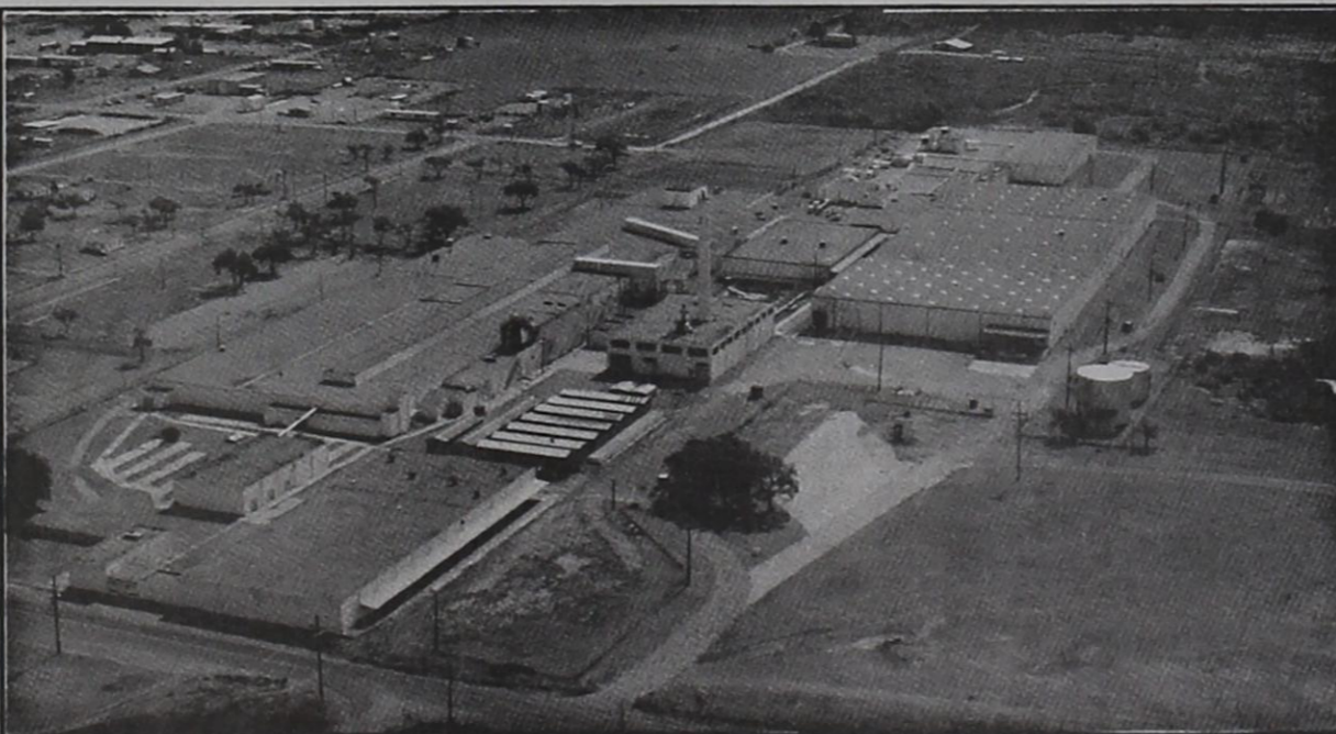
THE HISTORIC Postex Mill will be the site of this year's Black Tie and Boots dance and barbecue.

1993 should top them all; a new location filled with nostalgia. History and memories ooze from the "Old Mill", as it is sometimes referred. That's right! The Postex Mill is going to open its vast doors and enormous floor space for the Grand Black Tie