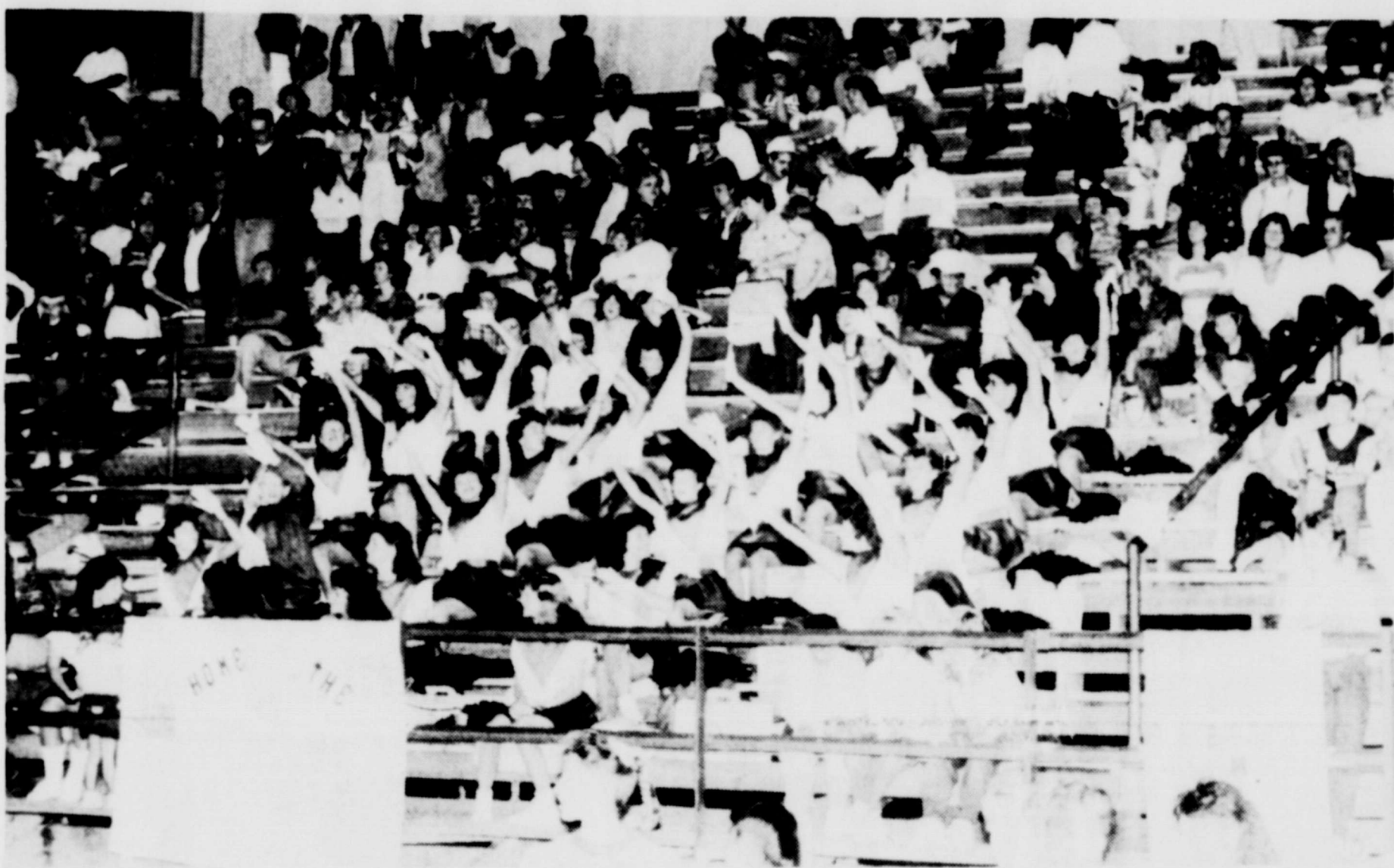
§ Badger fans had plenty to cheer about as the Badgers won their first home