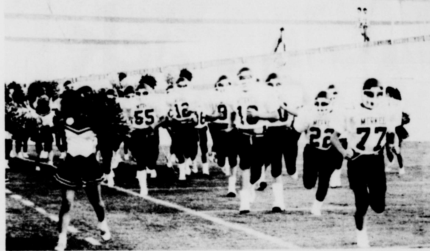
§ The Merkel Badgers take the field as they opened their season in Sweetwater Friday. The Badgers were downed 48-13

and hope to bounce back with a win over Cisco here Friday. Kickoff is set for 8