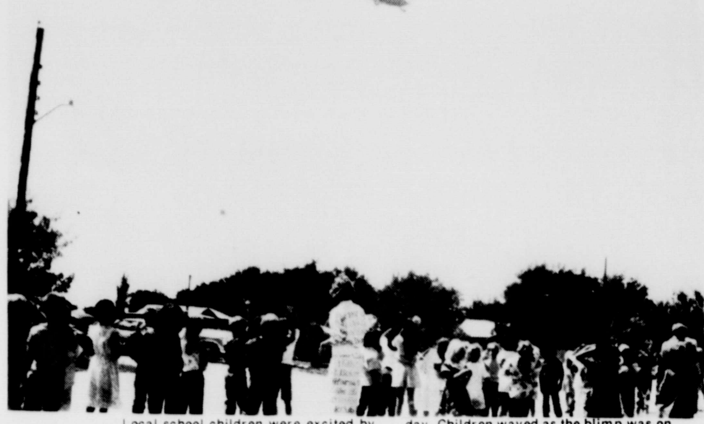
a surpirse visitor here last week when a blimp promoting a new location of the these park, Sea World, flew by Wednes-