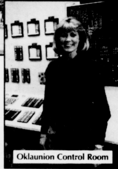
Oklauion Control Room