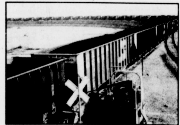
Coal Delivery at Oklaunion

Coal is still our best choice, especially over the long haul. The unlimited supply of clean-burning coal means more stable fuel prices and a continued reliable supply of electric energy for WTU customers.