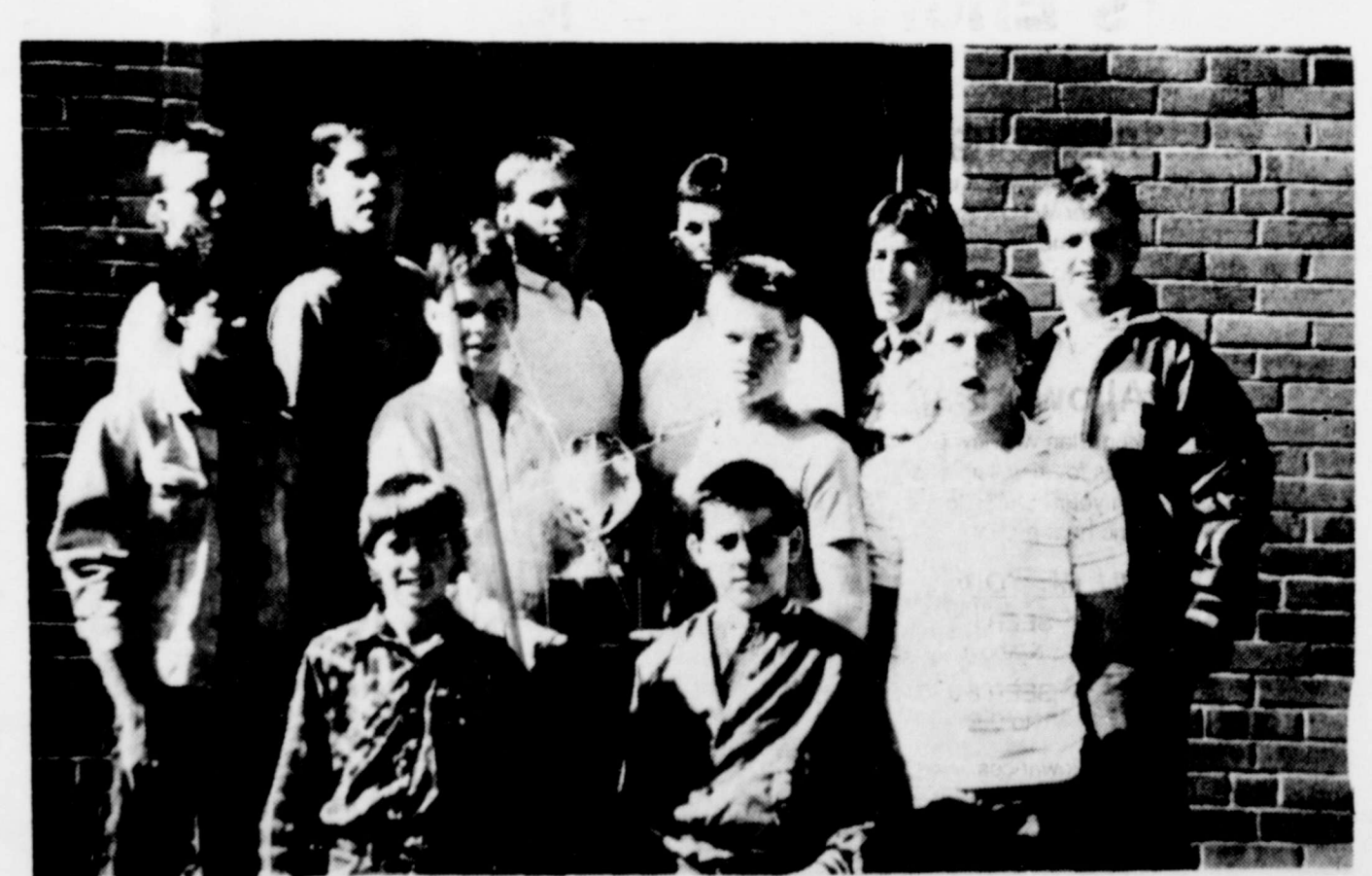
THE 1986 TRENT GORILLAS WITH THE ZONE CHAMPIONSHIP TROPHY