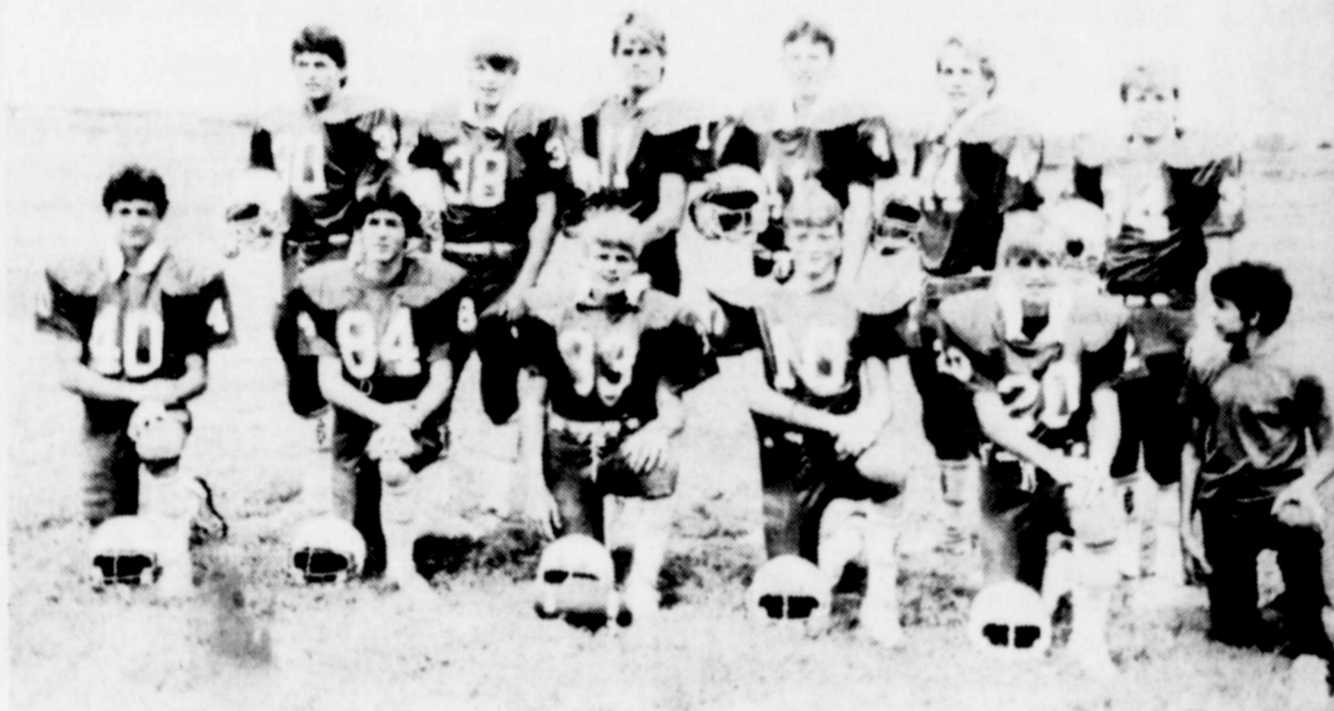
The 1986 Trent Gorillas

The City of Merkel is running 2.69 per cent ahead as they have collected $1,883.85 and the City of Trent is running 2.18 per cent ahead of 1985 as they have collected $270.81.