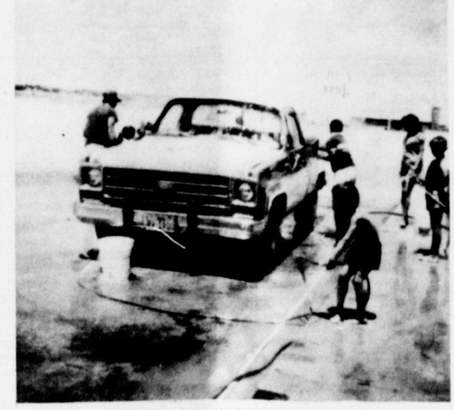
The local Allsup's store is holding car washes to

The economist cites these statistics. During the years 1953-64 (before the cattle futures market began), the average within-year seasonal change in steer and heifer prices was only $3.15 per hundredweight, or about 16 percent a year. After the commodity market went into action (1965-83), however, both the absolute difference and the percent changes in prices increased to $7.70 per hundredweight, or about $20 a