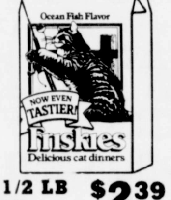
3 1/2 LB